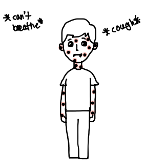
Along with the Black Death, there are complications such as the pneumonic plague. This gives you shortness of breath, chest pain, coughing, and blatty or watery mucus